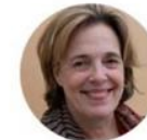
Ellen Lewis Lingerie Briefs