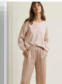
Lux Loungewear Skin