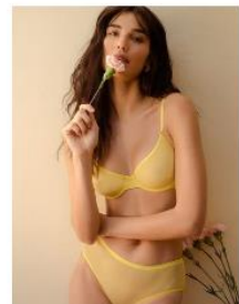
Pop of Color Cosabella