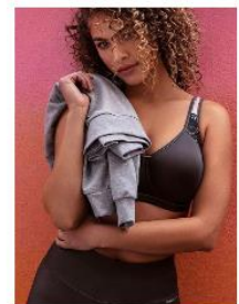
Zoom Class Ready Sports Bras Freya